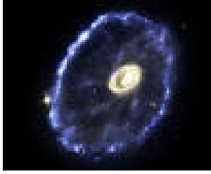
Elliptical Galaxy – Bright in center