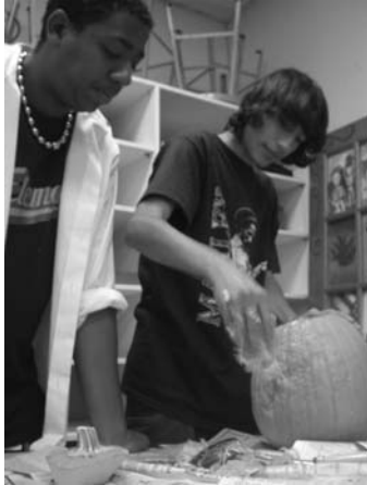
Figure 44 Pictures from Hastings High School. Used with permission.

Following are three pictures from a pumpkin carving contest. Write a single caption which will explain all three pictures to run as a picture story: