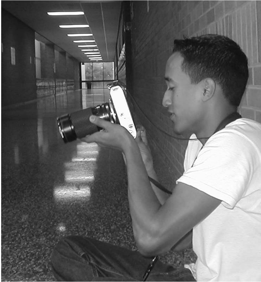
Figure 42: Photo from Hastings High School. Used with permission.