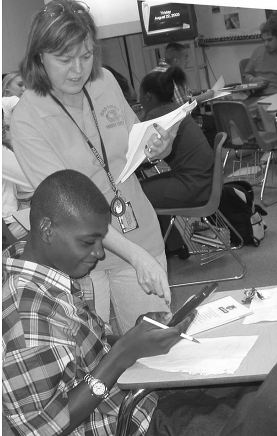
Figure 40