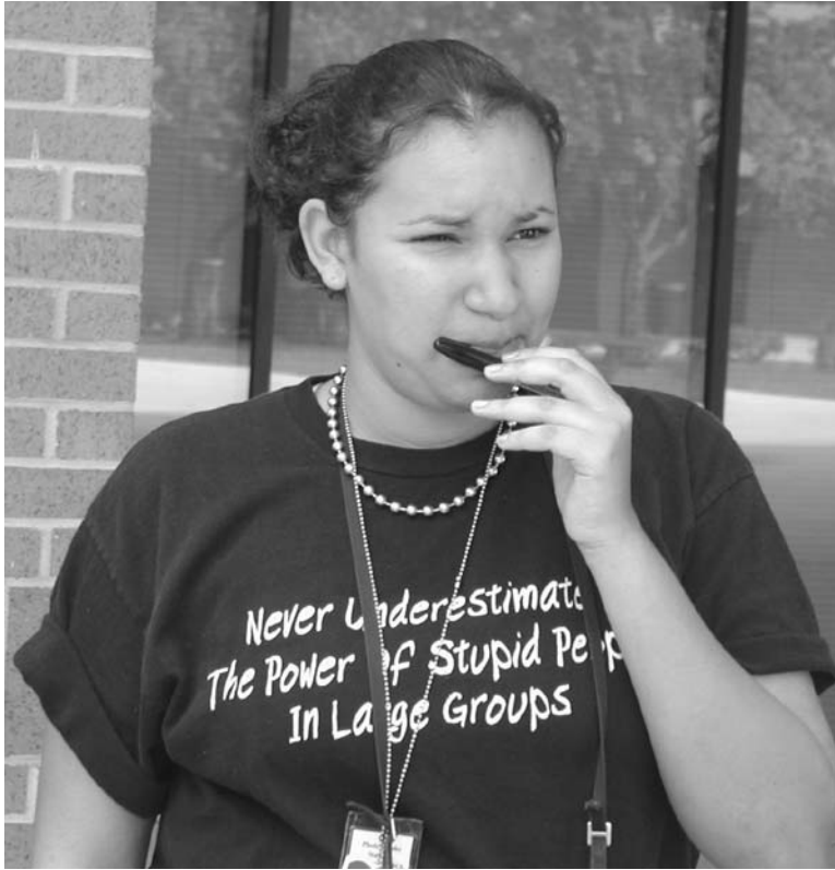
Figure 43: