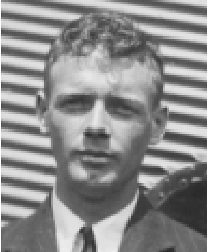
Charles Lindbergh 1927