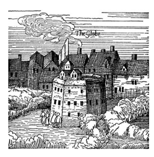
Shakespeare's Globe Theatre in a contemporary engraving.

Soliloquy: a speech in a play in which the character is alone on stage expressing his innermost thoughts without addressing the audience.