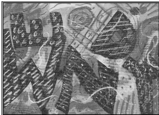
A sample of the finished project