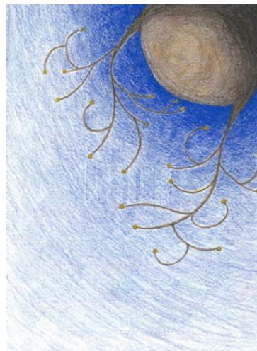
Figure 2 Rachel Robinson

Where the image appears to be weighed heavier on one side yet the image still appears to have an illusion of balance.