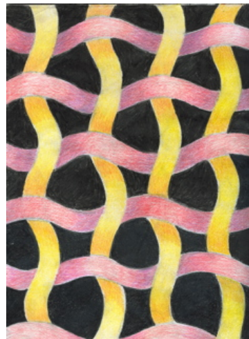
Figure 7 by Kate Legge

A Grid composition exists when the artwork appears to be flattened and covered with a repeated form. The image usually appears to be equitably balanced throughout the picture plane.