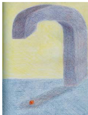
Figure 5 By Robyn Stewart

Proportion is used to establish a relationship of scale between visual elements.