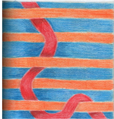
Figure 3 Caitlin Rose

Here, the red flowing vertical line stands out against the blue and orange horizontal straight lines.