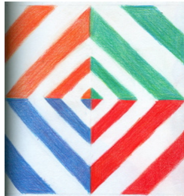
Figure 1: Rebecca McLellan

Where the image's illusion of balance appears to be equal on both the left and right sides.